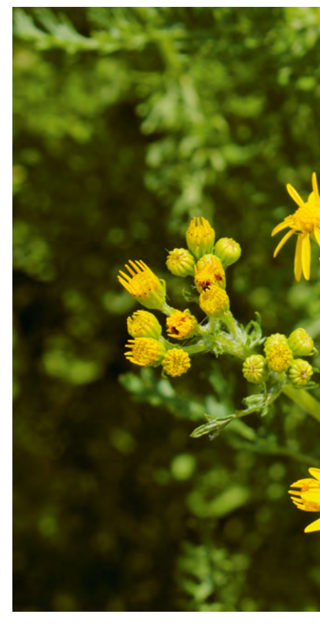
Plants which form pyrrolizidine alkaloids are to be found above all in the compositae (Asteraceae), "forget-me-nots" or borage (Boraginaceae) and legume (Fabaceae) families.

In addition to the development of analytical methods, the molecular mechanisms of the toxicity of 1,2-unsaturated PAs are also being examined at the BfR. The main focus here is on the examination of the structure-dependent intake of 1,2-unsaturated PAs via the intestinal barrier. The results show that the toxic potency of the 1,2-unsaturated PAs can differ due to differences in structure-dependent transport