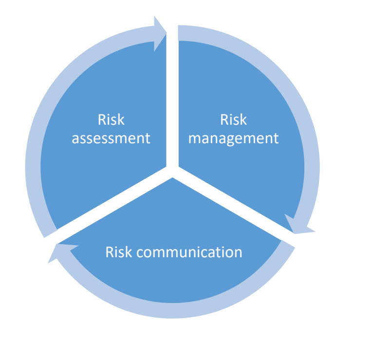
Figure 1: Schematic diagram of the risk analysis framework