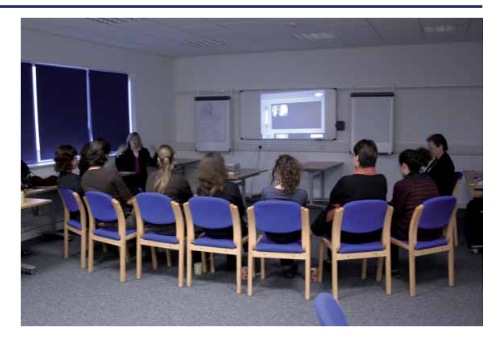
Working on presentation skills.

was still room for some social time. With the interns sharing three apartments, each with a mix of the four nationalities – Danish, Dutch, French and Italian – they enjoyed each other's cooking and challenges at pool and table football. And, of course, shopping and visits to London!