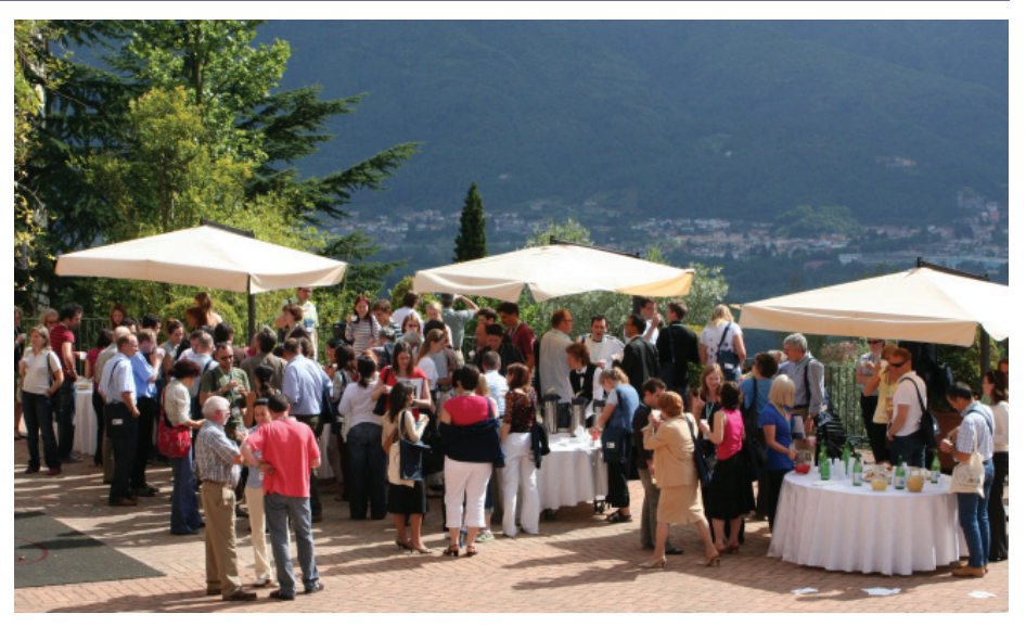
Coffee breaks on the terrace with views of the Tuscan mountains.

Another UK study about VTEC show that visiting open farms could be a risk, especially for young children. It also