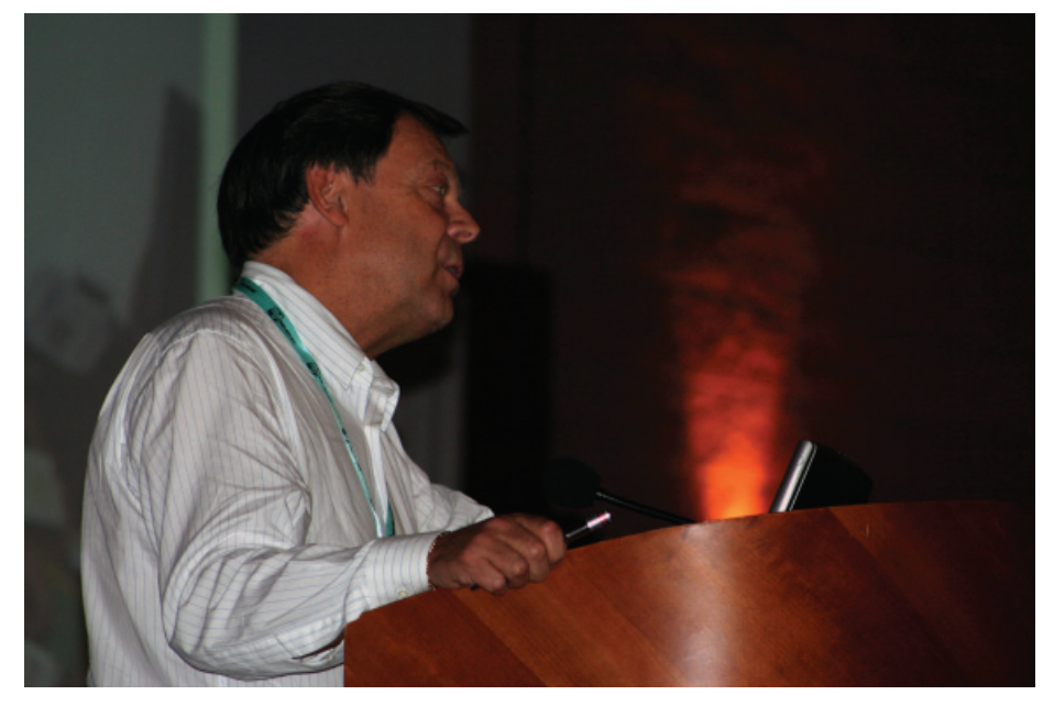
Professor Sir Howard Dalton speaking on 'Effects of climate change on infectious diseases'.

The session demonstrated some useful results which came out of Med-Vet-Net workpackages in a broad perspective covering detection of bacteria, viruses, and parasites in view of food safety.