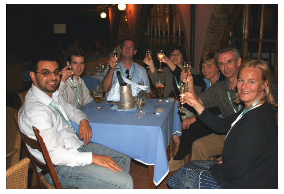
Proud quiz winners: a great example of multi-national collaboration!

Topics covered in the session on new and emerging zoonoses concerned mostly viral diseases of increasing concern due to their zoonotic potential and rising number of human cases. The presentations demonstrated clearly that only the combined efforts of veterinary and human experts will allow the timely detection of viral strains that can switch from animals to humans through food or direct contact. The Med-Vet-Net Workpackage 31 results were included in five presentations summarizing development of databases comparing hepatitis E virus (HEV) genomes from humans and swine, and seroprevalence surveys of HEV and tick-borne encephalitis virus in different countries. Three studies dealt with new threats related to well-known bacterial strains with established zoonotic potential: verotoxin-producing Escherichia coli (VTEC) and multi-drug resistant Salmonella enterica Phage Type U311. The authors stressed the need to develop different surveillance models to integrate epidemiological and advanced bacteriological methods allowing close monitoring of new virulent bacterial clones. This in turn will allow timely