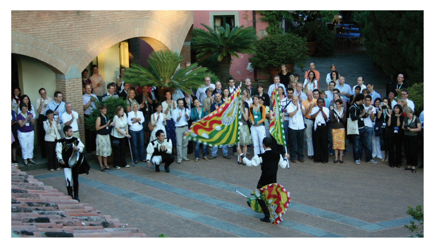
A tradition 'flag waver' from the local troupe shows off his skills to the meeting participants.

Finally, a German study summarizing a hantavirus outbreak investigation from 2005, stressed the need to monitor closely known zoonoses which can reemerge due to changes in climate and the environment.