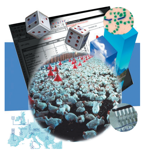
Risk assessment, epidemiology and economics all need to be integrated

These are long term goals and the first steps will be taken in WP13.