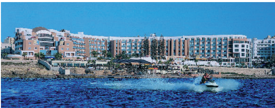
Dolmen Resort Hotel, Malta

The sun and sea is now not far away. This time next week we shall be in Malta – working hard of course. At the time of going to press, we have 184 delegates registered of whom 43 are external to the network, including several from the USA and Canada. We have been very fortunate to receive support from several sources including the FAO and Pfizer which will help to support the attendance of PhD students, experts in food safety and guests from non-European countries. As I look out my window in the United Kingdom, it is raining and cold – so the thought of sun and sea is a welcome incentive to finish this newsletter and start packing!