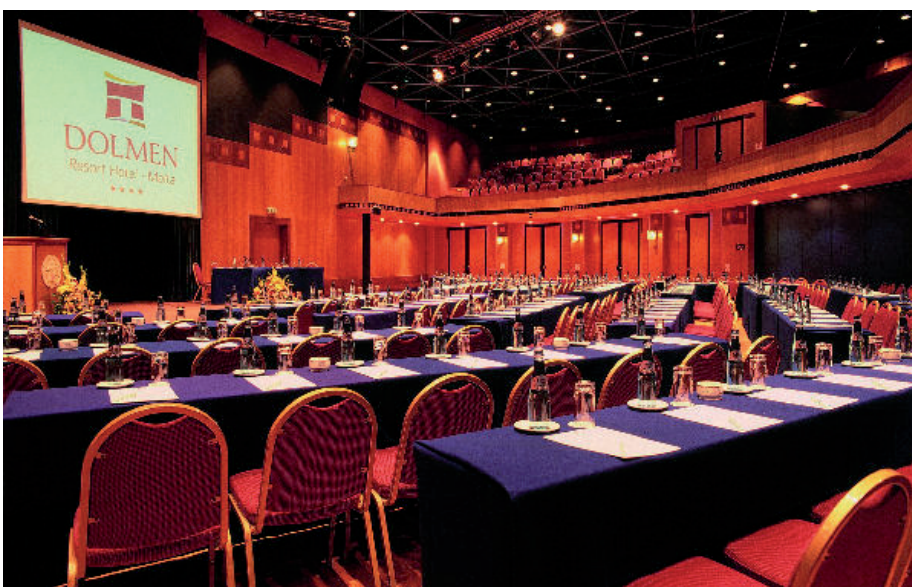
Oracle conference centre at the Dolmen Resort Hotel, Malta