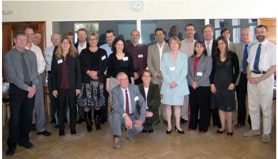
Participants at the third Co-ordinating Forum meeting in Madrid