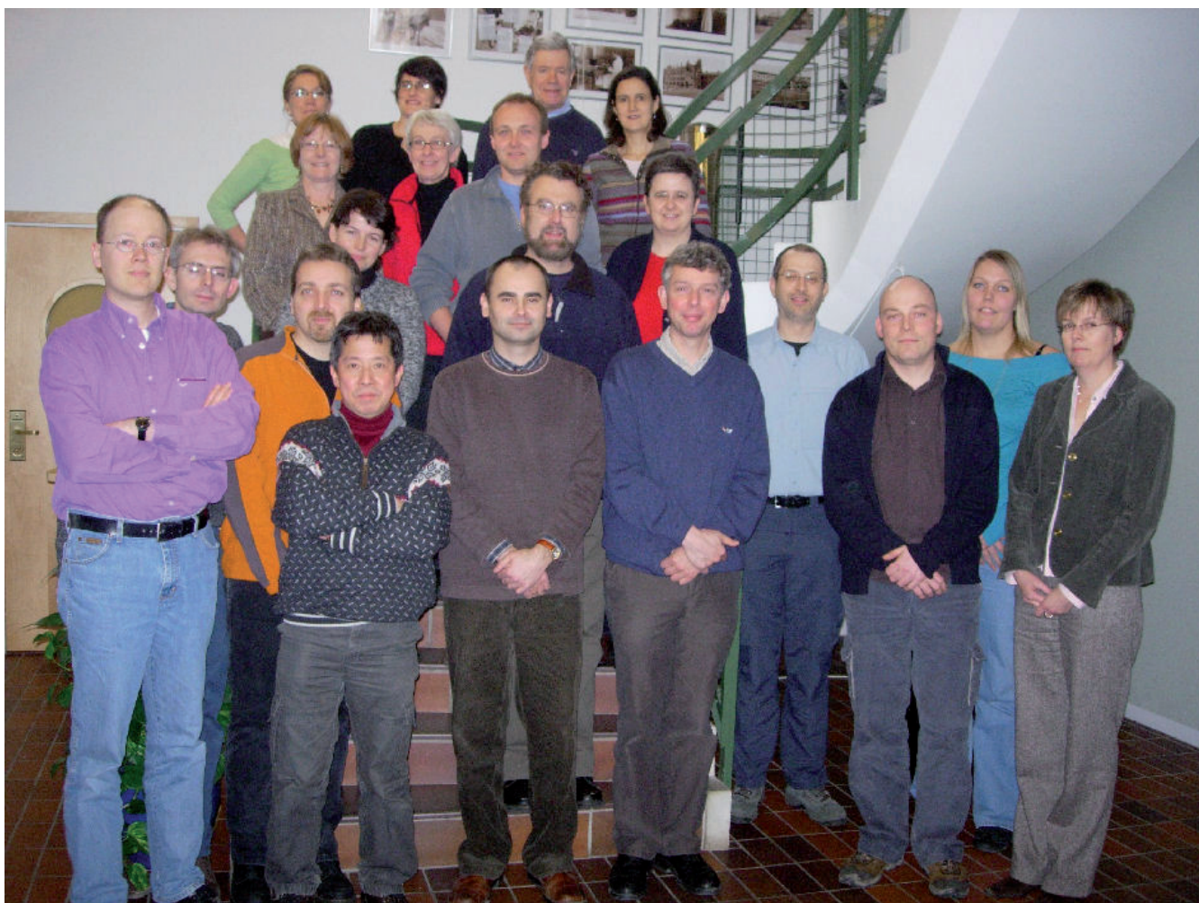
Participants in the Workpackage 30 kick-off workshop, National Veterinary Institute (SVA) in Uppsala, Sweden